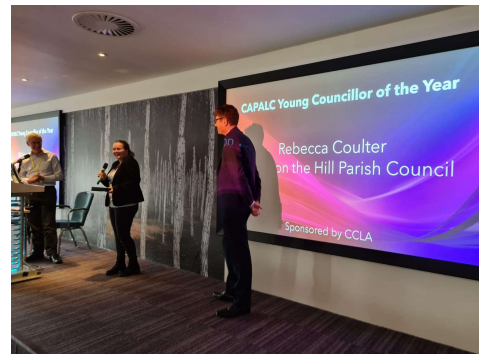
Above right: CAPALC Annual Conference, Sept 2021

NB. CAPALC provides 8 hours confidential advice if your council is in difficulties & reserves the option to negotiate & charge addition fees should further work on the same issue be required.